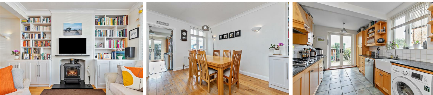
Ground Floor Approx. 465.6 sq. feet

A bright and spacious three double bedroom Victorian end terrace home set in the heart of St. Albans. This property will appeal to the busy professional, commuter or family who are looking for city centre living, good restaurants, plenty of outdoor places for leisure and socialising, excellent schools and easy access to the two stations, linking St. Albans to London in approximately 30 minutes. Accommodation is arranged over two floors with an entrance hall leading to the sitting/dining room having a log burner and oak panel floor. Off the dining room there is a spacious kitchen with integrated hob and oven, granite worktops and double glazed French doors opening to the garden. On the first floor there are three double bedrooms and well-appointed modern family bathroom. The landscaped rear garden is fully enclosed offering a high degree of privacy and has the rare benefit of sheltered side access.